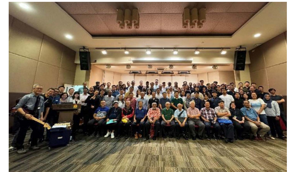
Alumni group shot

With many SMA alumni going on to become captains of industry, successful entrepreneurs, and professionals in Singapore and beyond, SP hopes to continue the long-standing relationship and collaboration opportunities with all SMA alumni.