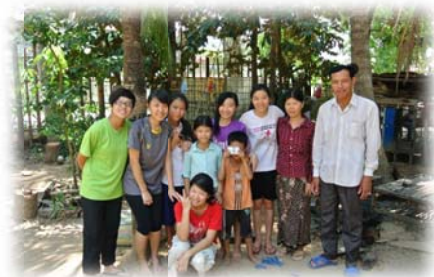
House visit to Theara House