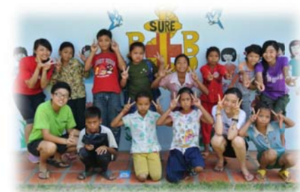
Last class photo with my students

I am really thankful for the opportunity to participate in this 14-days OCIP with Team F.M.W, Singapore Polytechnic. Throughout this 14-days, I experience, I learn, I serve. The relationships forged with the kids in Cambodia as well as my teammates and lecturers, the experiences and the memories is definitely a priceless and memorable one, which will be etched in my heart forever.