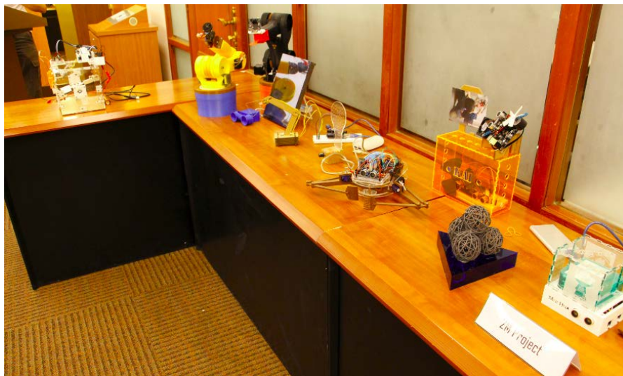
Display of the Final Products