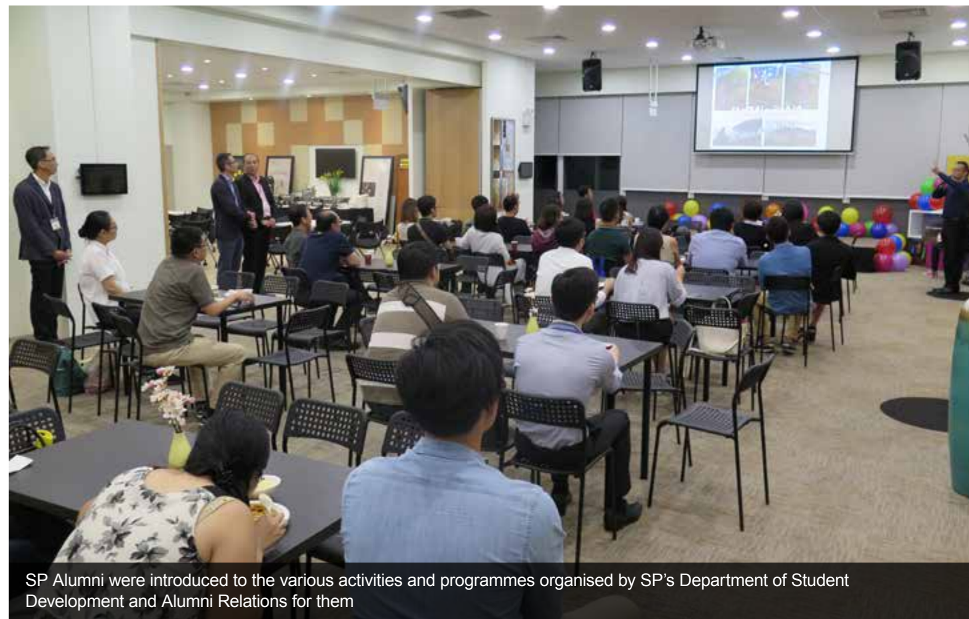
SP Alumni were introduced to the various activities and programmes organised by SP's Department of Student Development and Alumni Relations for them