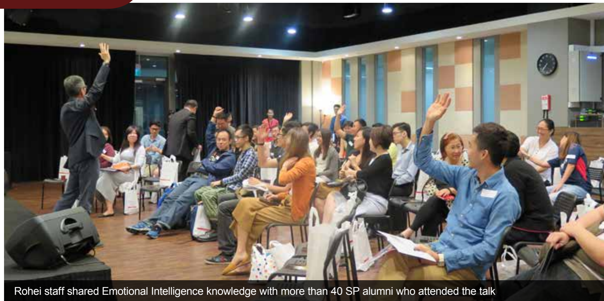
Rohei staff shared Emotional Intelligence knowledge with more than 40 SP alumni who attended the talk