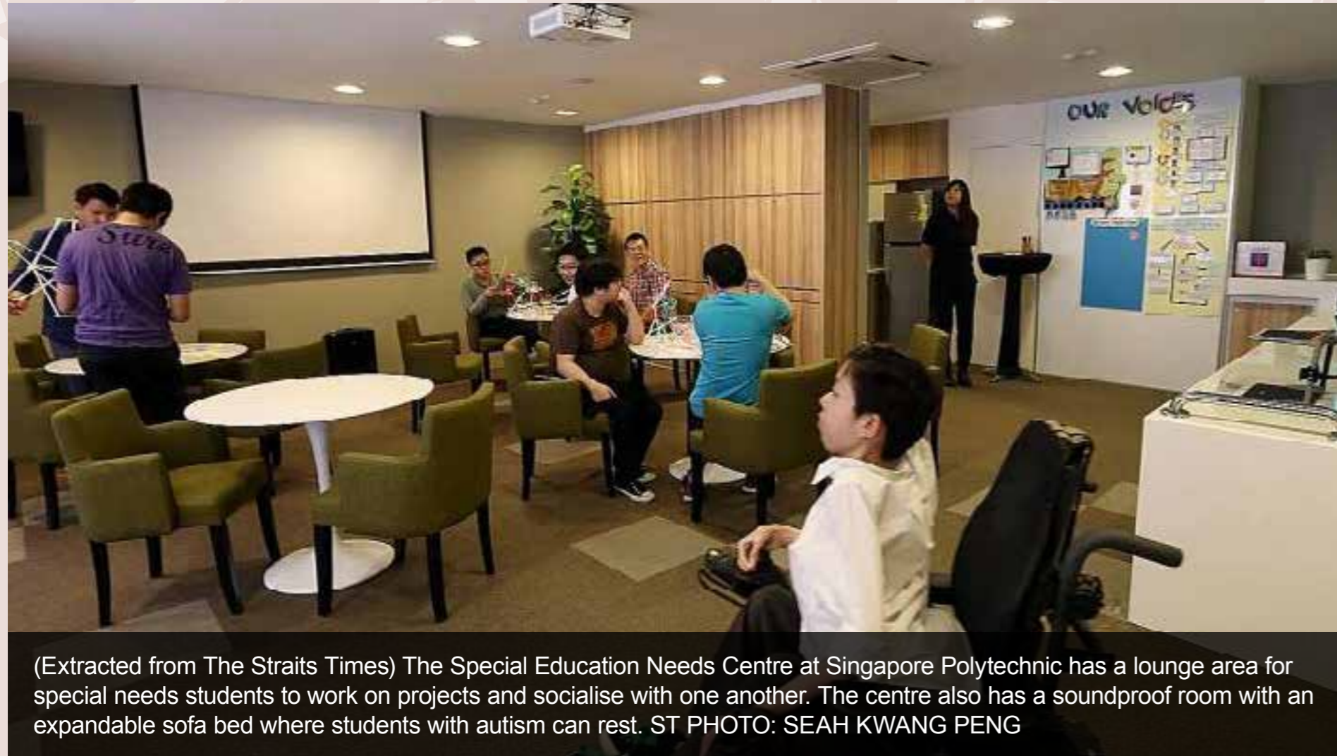
(Extracted from The Straits Times) The Special Education Needs Centre at Singapore Polytechnic has a lounge area for special needs students to work on projects and socialise with one another. The centre also has a soundproof room with an expandable sofa bed where students with autism can rest. ST PHOTO: SEAH KWANG PENG