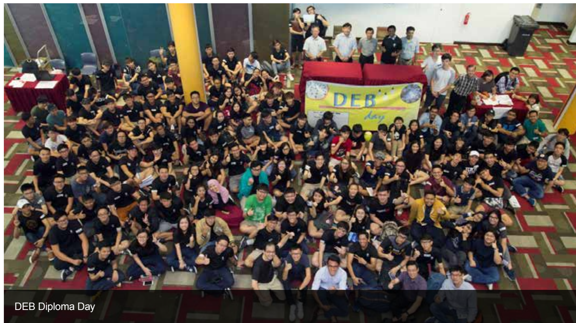
DEB Diploma Day

Students from the Diploma in Engineering with Business (DEB) took a break from their studies to be energised, refreshed and enlivened at the DEB Diploma Day 2016 on Wednesday, 2 November 2016.