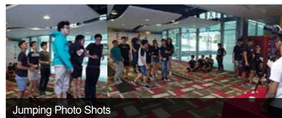
Jumping Photo Shots