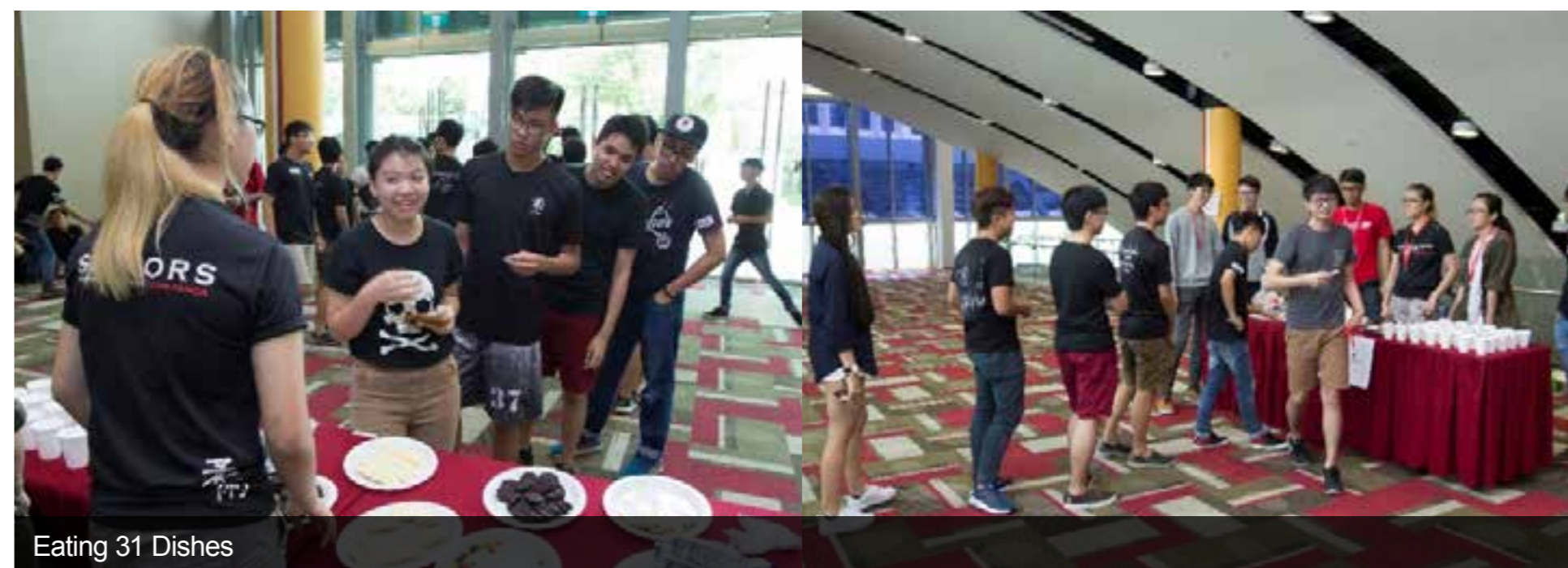
Eating 31 Dishes