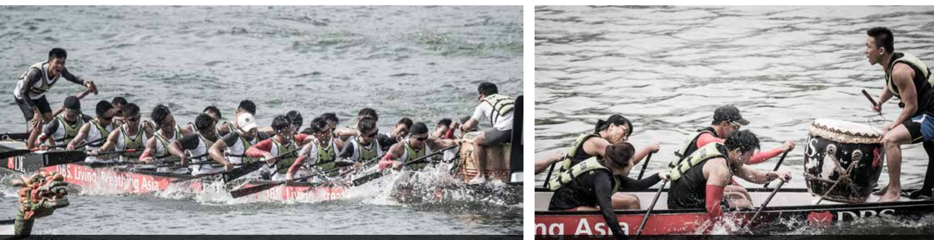
DBS MR2016, Premier Open, 22-crew, Men, with SP Alumni coming in 1st for Minor Finals.

Formed in the late 1980s, Singapore Polytechnic (SP) Dragon Boat Team is an elite sports club that strives for excellence – both physically and mentally. Their motto: One Stroke, One Heart. This year, a group of passionate alumni set out to bring the graduates back to paddle together and relive old memories, hence SP Alumni Dragon Boat Team was formed.