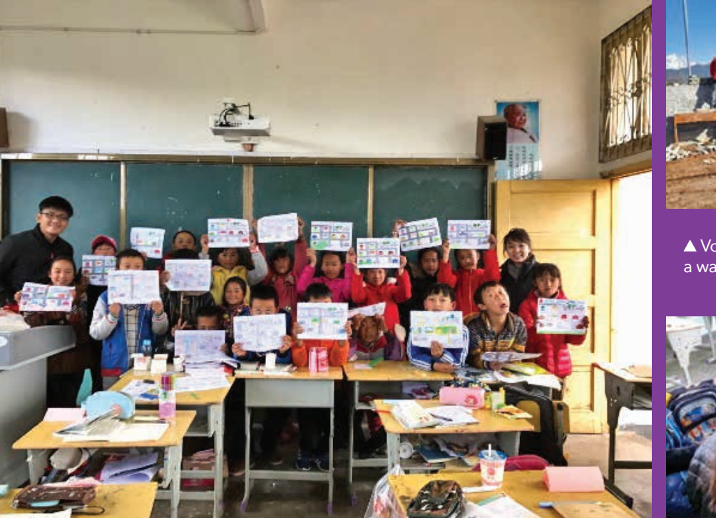
▲ Children are guided to learn directions from the colourful road maps

medical conditions and engaged their families with craftwork. An Easter carnival was also organised by the volunteers to bring joy to the children. Not only did the children had a fun time, the volunteers enjoyed themselves too.