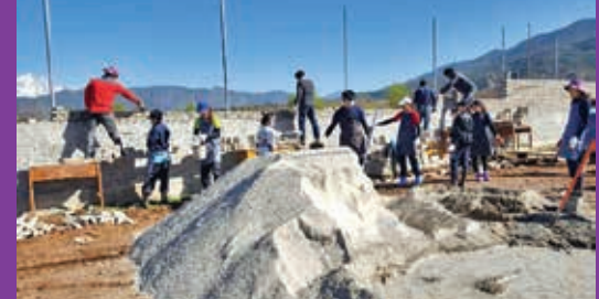
▲ Volunteers helped with cement work to build a wall at the sports field