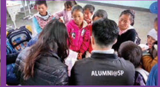
▲ Volunteers reading stories to the children