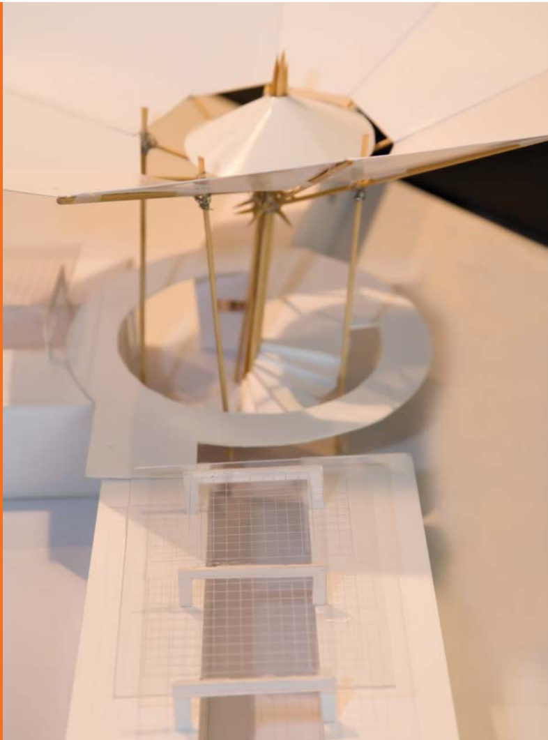
Model of InnoVillage@SP.

Driven by its four main thrusts of Applied and Translational R&D; Academic Entrepreneurship and Incubation of Technopreneur Ventures; Testbed and Showcasing of Emergent Technologies, Products and Services; and Capability Development of Academia and