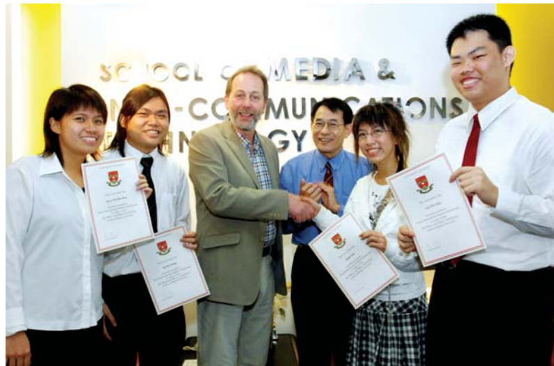
Four outstanding Singapore Polytechnic students receiving the prestigious Keele University Scholarship.

The School of Media and Info-Communications Technology signed several important Memoranda of Co-operation (MOC) with key industry partners in the year. On 12 December 2007, it signed an MOC with Infinite Frameworks Pte Ltd. As a result, students will be able to work on actual