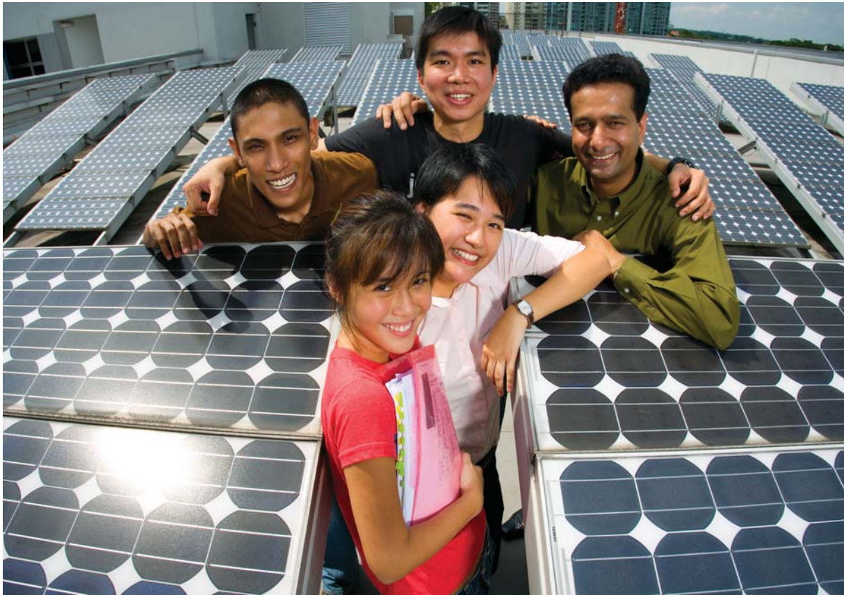
New course in Clean Energy.

Firms are constantly seeking to employ business executives with a good understanding of global affairs and a sound knowledge of international business and trade practices. The International Business and Trade option was added to the Diploma in Business Administration in response to this growing demand.