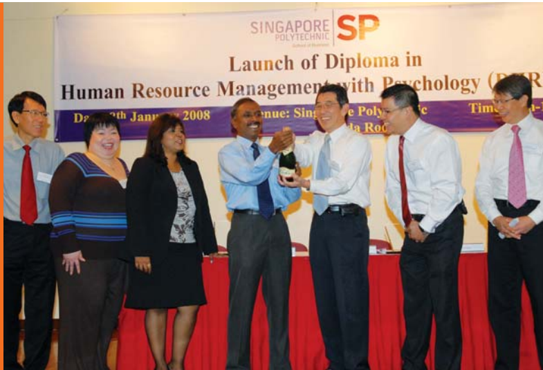
Launch of full-time Diploma in Human Resource Management with Psychology course – a first.