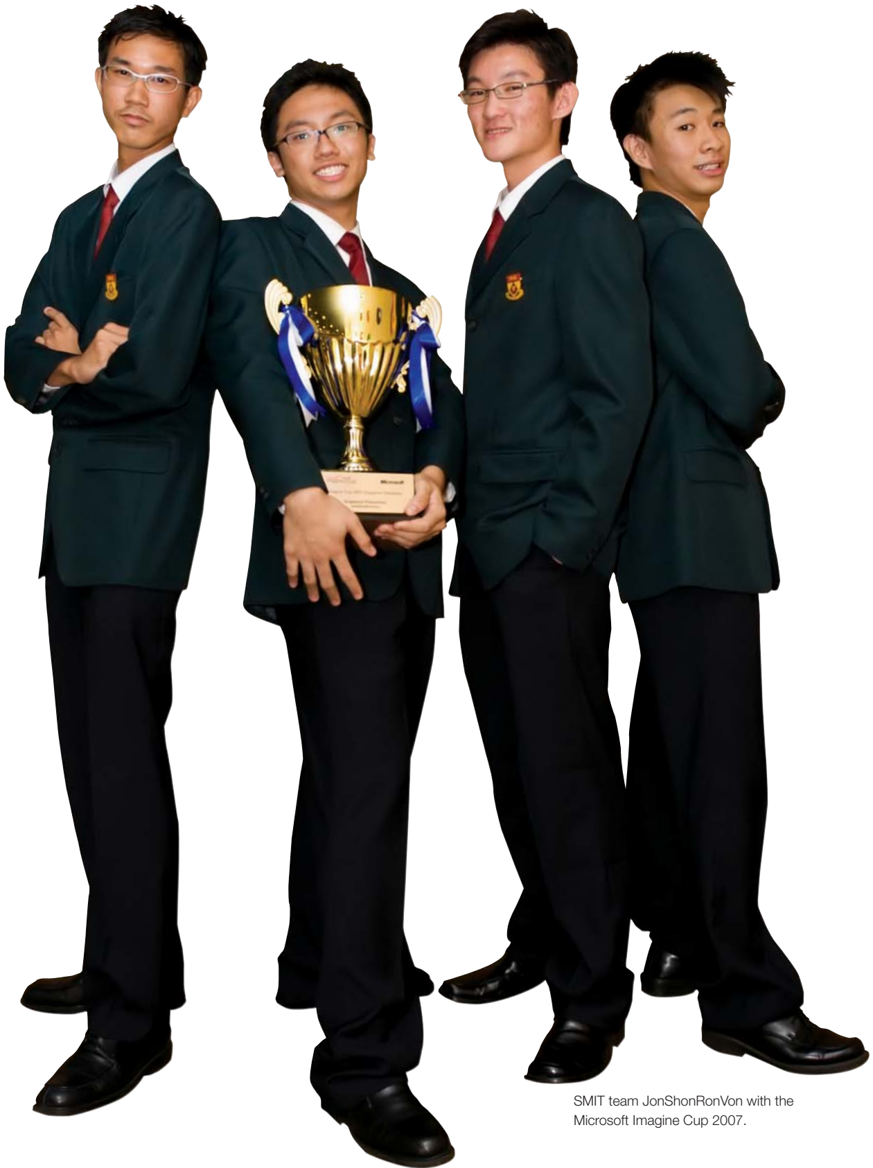
SMIT team JonShonRonVon with the Microsoft Imagine Cup 2007.