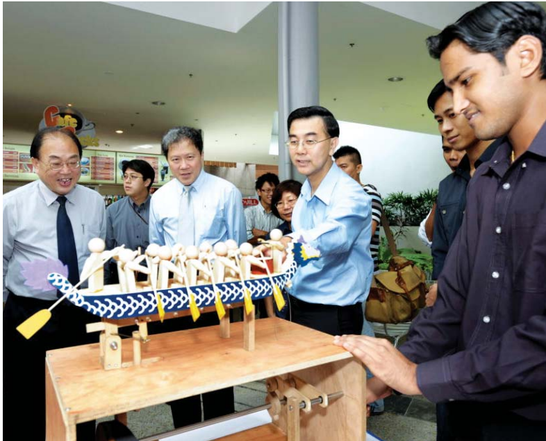
Mechanical and Manufacturing Engineering students top the Cabaret Mechanical Theatre Competition 2007.

Students at the School of Electrical and Electronic Engineering did the School proud in international competitions, too. A team of 16 staff members and students participated in the RoboCup 2007 competition held in Atlanta, USA in July 2007. The team came in fourth in the Humanoid Teen Size League (Robo-Erectus Senior) and was in the top eight in the Humanoid Kid Size League. The School also won two golds, three silvers and three bronzes in the Singapore Robotic Games, held from 8 to 10 January 2008.