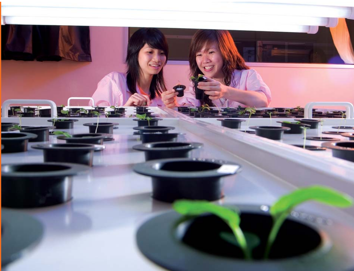
School of Chemical and Life Sciences introduces more courses for students, including a Specialist Diploma in Biotechnology.

Singapore Polytechnic constantly looks to revamp courses to keep them relevant to industry. As such, changes were made to the Diploma in Civil and Structural Engineering course over at