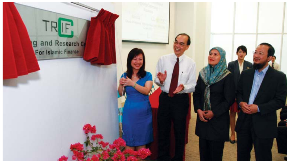
New Training and Research Centre for Islamic Finance presents new opportunities for students.

To address the needs of the industry, a new Training and Research Centre for Islamic Finance was established by the School of Business with Glohex Groups Pte Ltd in association with Singapore Business Federation on 13 June 2007. With the opening of this centre, Singapore Polytechnic's business students have the opportunity to take up Islamic Finance elective modules. It also serves as a centre for research and innovation for the Islamic banking and finance industry in Singapore, concentrating on the structuring of Islamic finance instruments.