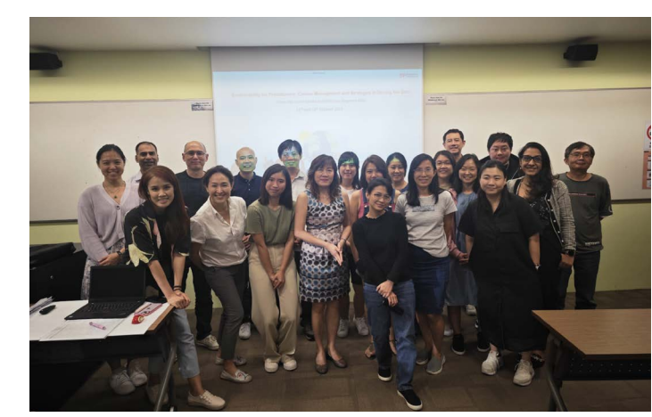
Class photo to commemorate the first-run of the course

The School of Chemical and Life Sciences had its first run of a new two-day short course on carbon management and strategies on 12th October 2023. Funded by SkillsFuture Singapore (SSG), this Continuing Education & Training (CET) certificate course is tailored for professionals who have an interest in topics such as greenhouse gas (GHG) inventory, and are looking to apply the knowledge to their own companies or organisations. The course provides valuable insights into the latest Environmental, Social and Governance (ESG) developments, with a specific focus on GHG Scope classifications, as well as a look at Singapore's Green Economy initiative.