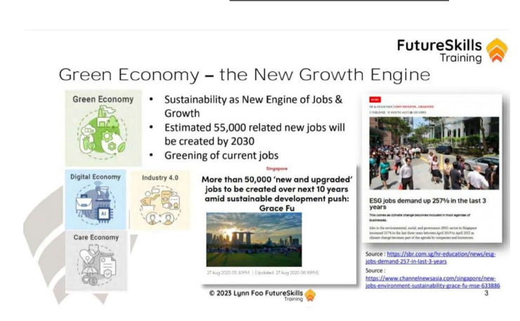
The course provides a closer look at Singapore's Green Economy initiative.

To sign up for the course &/or work with the School of Chemical & Life Sciences in areas such as student internship placement or projects (consultancy or student project), please write to CLS_alumni@sp.edu.sg.