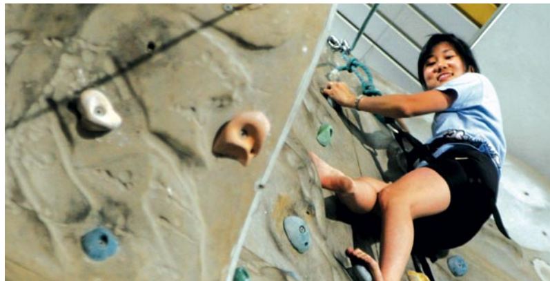
A variety of half-day workshops and expeditions were conducted, ranging from 3D digitising used in Hollywood movies, to rock climbing, to a behind-the-scenes look at the Esplanade.

A cross-disciplinary innovation programme named MAGELLAN was started by the Department to encourage staff to break out of familiar knowledge territories and discover new ways of looking at things.