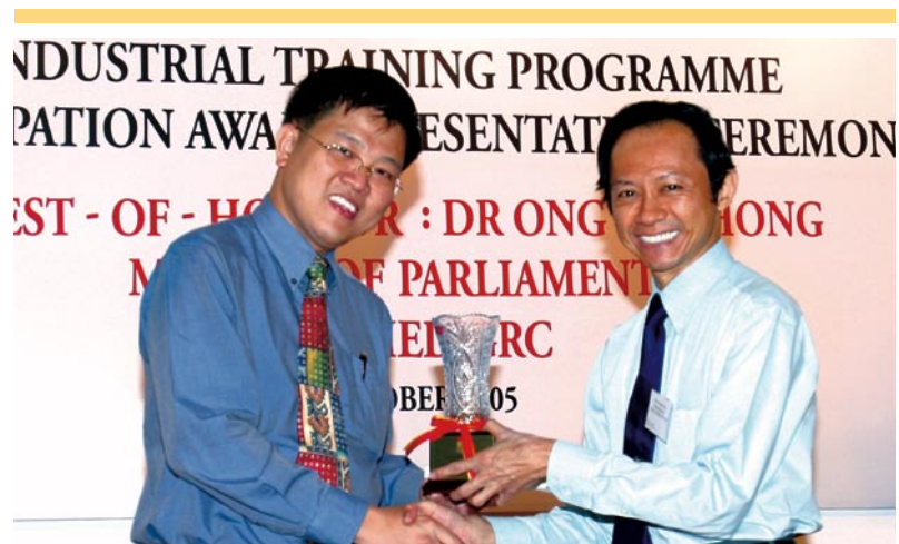
A total of 57 companies were presented with awards at the Industrial Training Programme Awards Presentation Ceremony to thank them for their support.

The Department continued to honour external trainers and partners at the Continuing Education Awards Presentation Ceremony which was held on 26 August 2005.