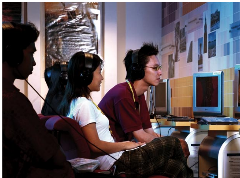
Overall, 98% of students were satisfied with the quality of library services.

In addition, a series of Personal Experience Talks (PETs) was launched in July 2005 by the Library to provide staff with a platform to network and share on their pet topics.