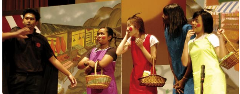
Students taking the Drama Appreciation Module demonstrated their creativity in Showtime 2005.

The Foreign Language unit offered Spanish and Korean classes for the first time and published the sixth issue of their Japanese language newsletter, Hoshi No Shinbun. Popular French films were also screened to help students and staff enhance their knowledge of the culture and country. In addition, a course on French dining etiquette was held at Café D'Amigo.