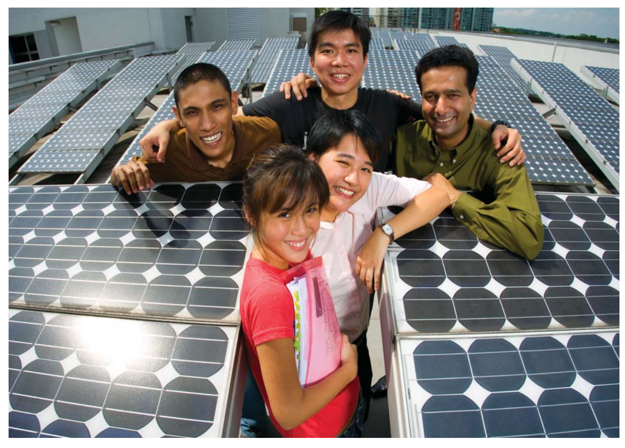
New course in Clean Energy.

Firms are constantly seeking to employ business executives with a good understanding of global affairs and a sound knowledge of international business and trade practices. The International Business and Trade option was added to the Diploma in Business Administration in response to this growing demand.