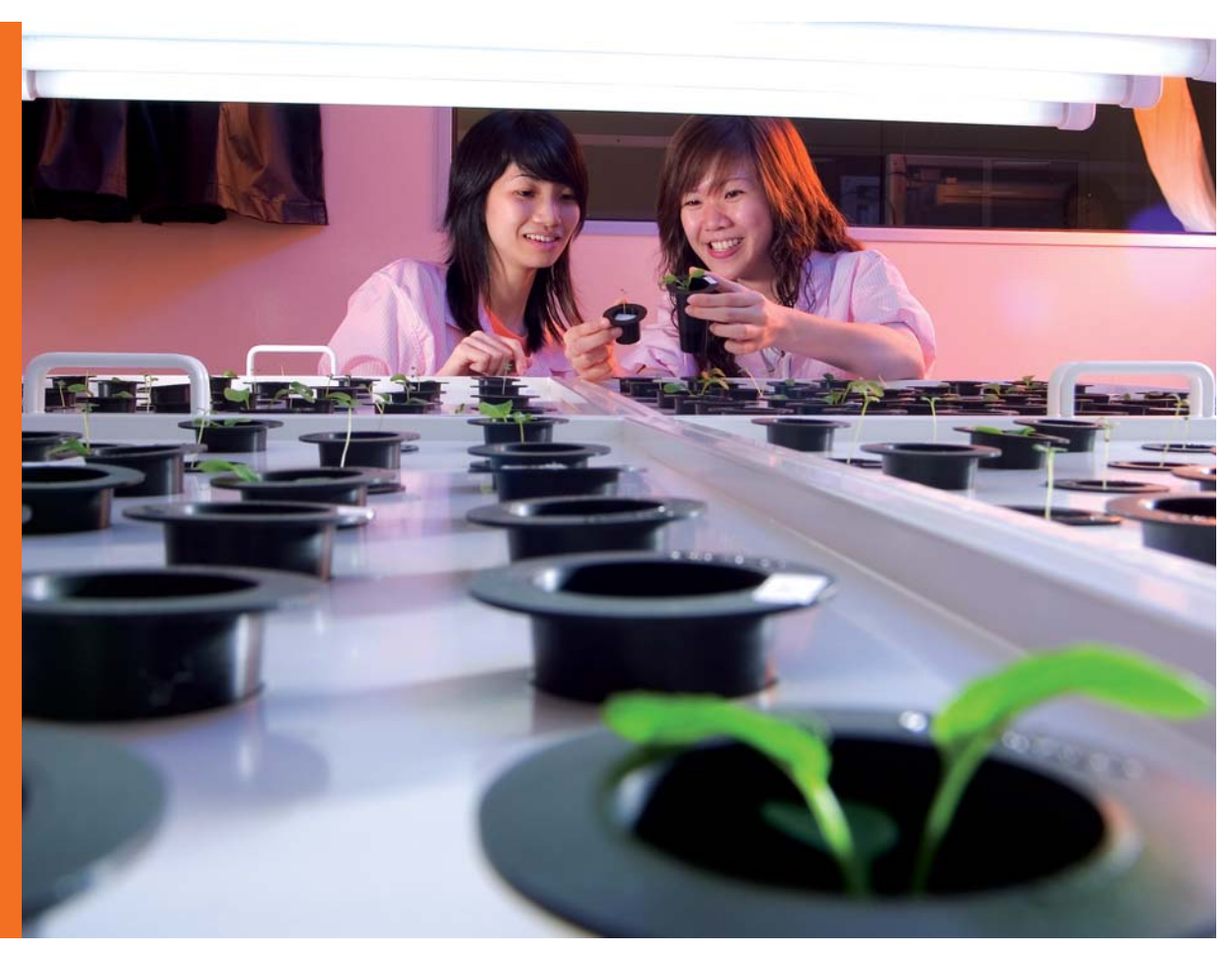
School of Chemical and Life Sciences introduces more courses for students, including a Specialist Diploma in Biotechnology.

Singapore Polytechnic constantly looks to revamp courses to keep them relevant to industry. As such, changes were made to the Diploma in Civil and Structural Engineering course over at