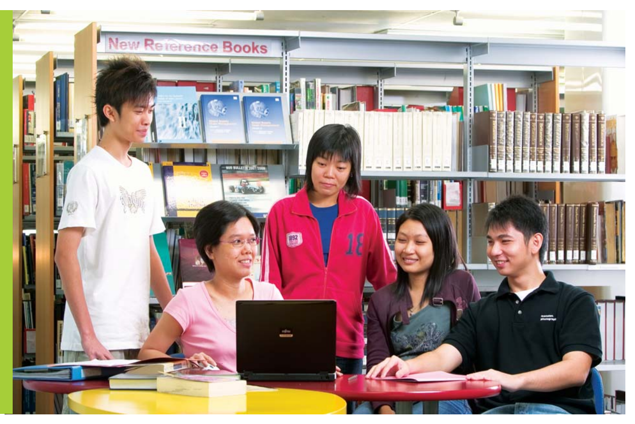
A librarian guiding students to relevant resources for their final-year project through the Project Advisory Service.

Efforts to promote library resources and services have boosted the loan of materials to 329,241. To facilitate seamless connection to materials, a project to map library resources to course modules was initiated. A "Library Resources" section was added to the electronic learning platform, Blackboard, to provide links to recommended textbooks, project resources, exam papers and the ELISER portal.