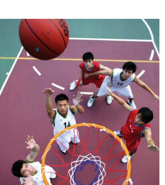
Never a dull moment at Singapore Polytechnic.

Students had many opportunities to develop themselves through a myriad of programmes and activities. In the year under review, the number of competitive sports teams stood at 39 and student clubs on campus increased to 89. These offered students a diverse choice of activities in area like arts and culture, development, general interest and