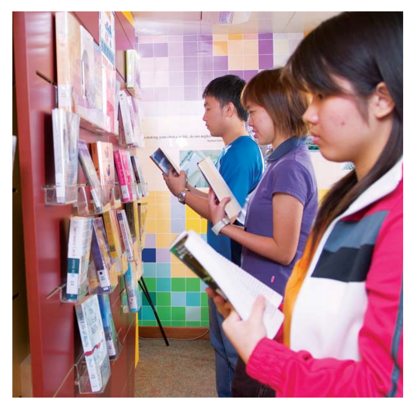
Newly released books add to the wide range of materials available at the Library.

E-books doubled in numbers to 41,170 titles, while the library's total collection of books and multimedia increased to 251,148 this year. Its resources were strengthened with new databases such as e-Gazette, Productscan Online and REALIS, a URA real estate database. Its e-library resources were well utilised with 900,354 searches conducted in the year.